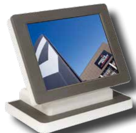
One digital display and one display for customer (graphic)