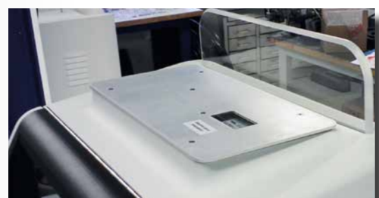
Integration into a free-service franking kiosk