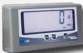
One digital display and one display for customer (digital)